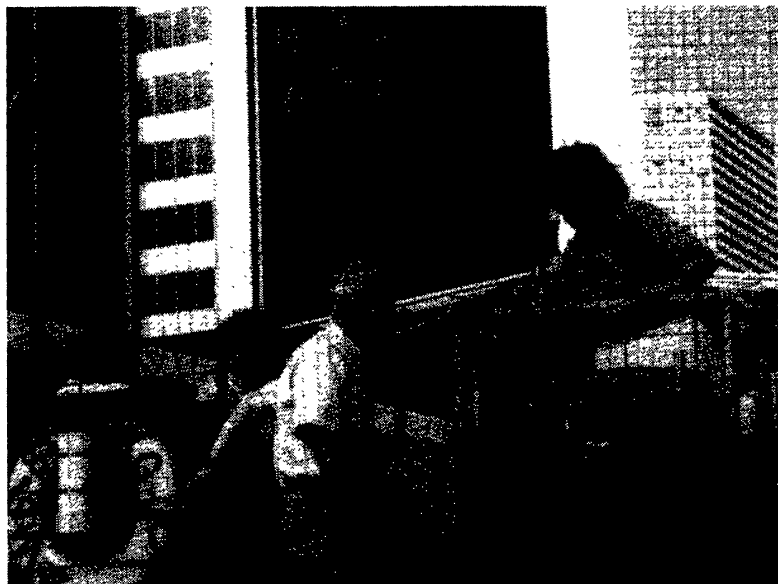
“Last one aboard is all wet...so is the first one.”