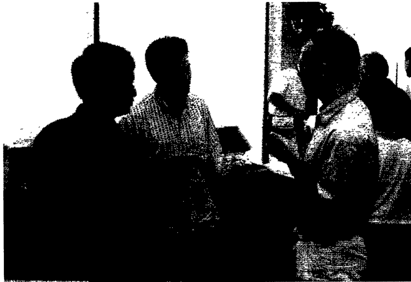
On the CD you will observe the nice amber color being discussed.