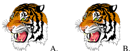
Figure 4. A) This is a figure. B) Second subfigure