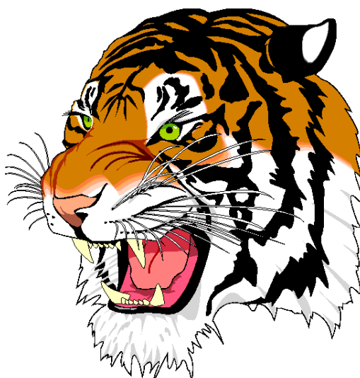
Figure 3. This is the caption of the figure. This is the tiger from the GhostScript distribution.