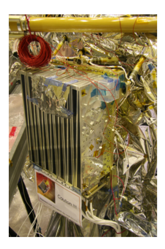
Fig. 3: The HIFI's local oscillator. The instrument is the most sensitive spectrometer ever built for observations in the far infrared.